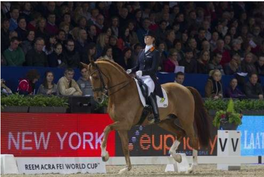
Photo caption: Defending series champions, Adelinde Cornelissen and Jerich Parzival from The Netherlands, were emphatic winners of the sixth leg of the Reem Acra FEI World Cup™ Dressage 2011/2012 series at Mechelen in Belgium.