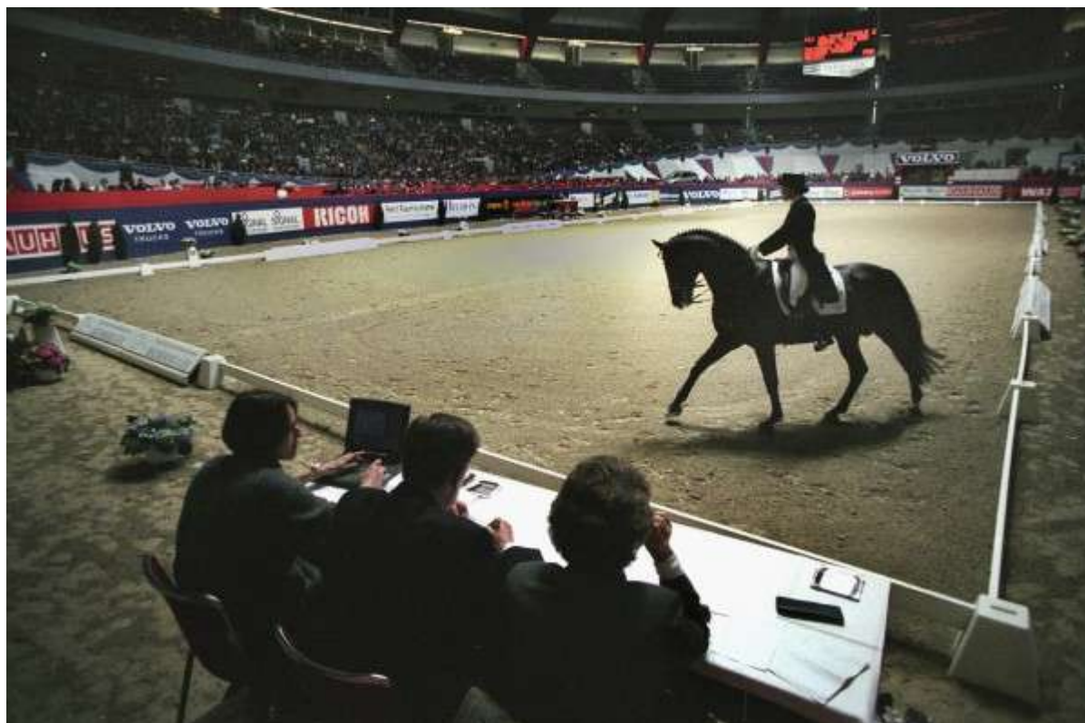
Photo caption: The arena of the FEI World Cup™ Dressage Final 1996 in Gothenburg (SWE)