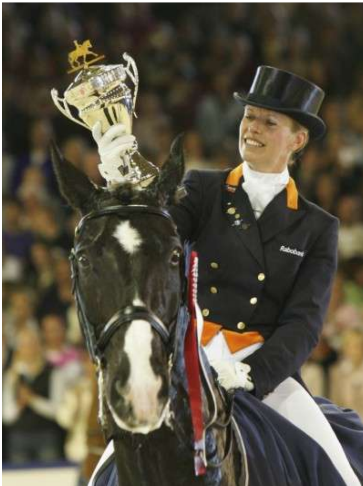
Photo caption: Dutch legend Anky van Grunsven is the only rider who has won the coveted FEI World Cup™ Dressage title on nine occasions with two horses, Bonfire and Salinero.

The complete FEI World Cup™ Dressage rules for the 2011/2012 are available HERE .