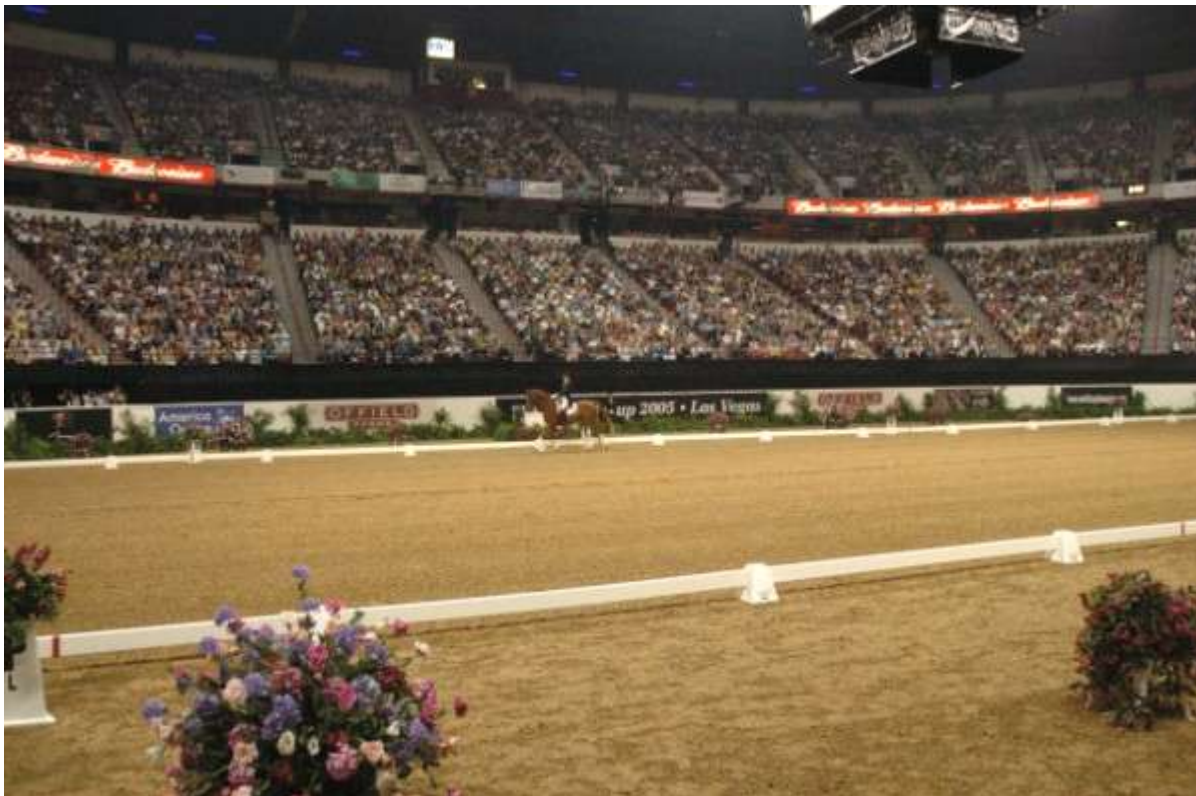
Photo caption: The Thomas & Mac Centre in Las Vegas (USA) was sold out for the FEI World Cup™ Dressage Final 2005. It was the first time that the FEI World Cup™ Jumping and Dressage Finals were held simultaneously.

The Grand Prix Freestyle to Music will be broadcast LIVE on Saturday, 21 January, at 12.25 CET.