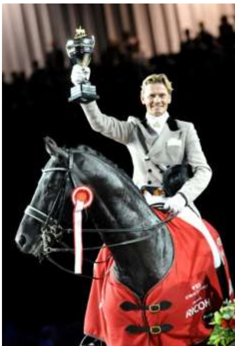
Photo caption: Edward Gal (NED) and the super-stallion Totilas claimed the 25 th anniversary FEI World Cup™ Dressage title in 2010.